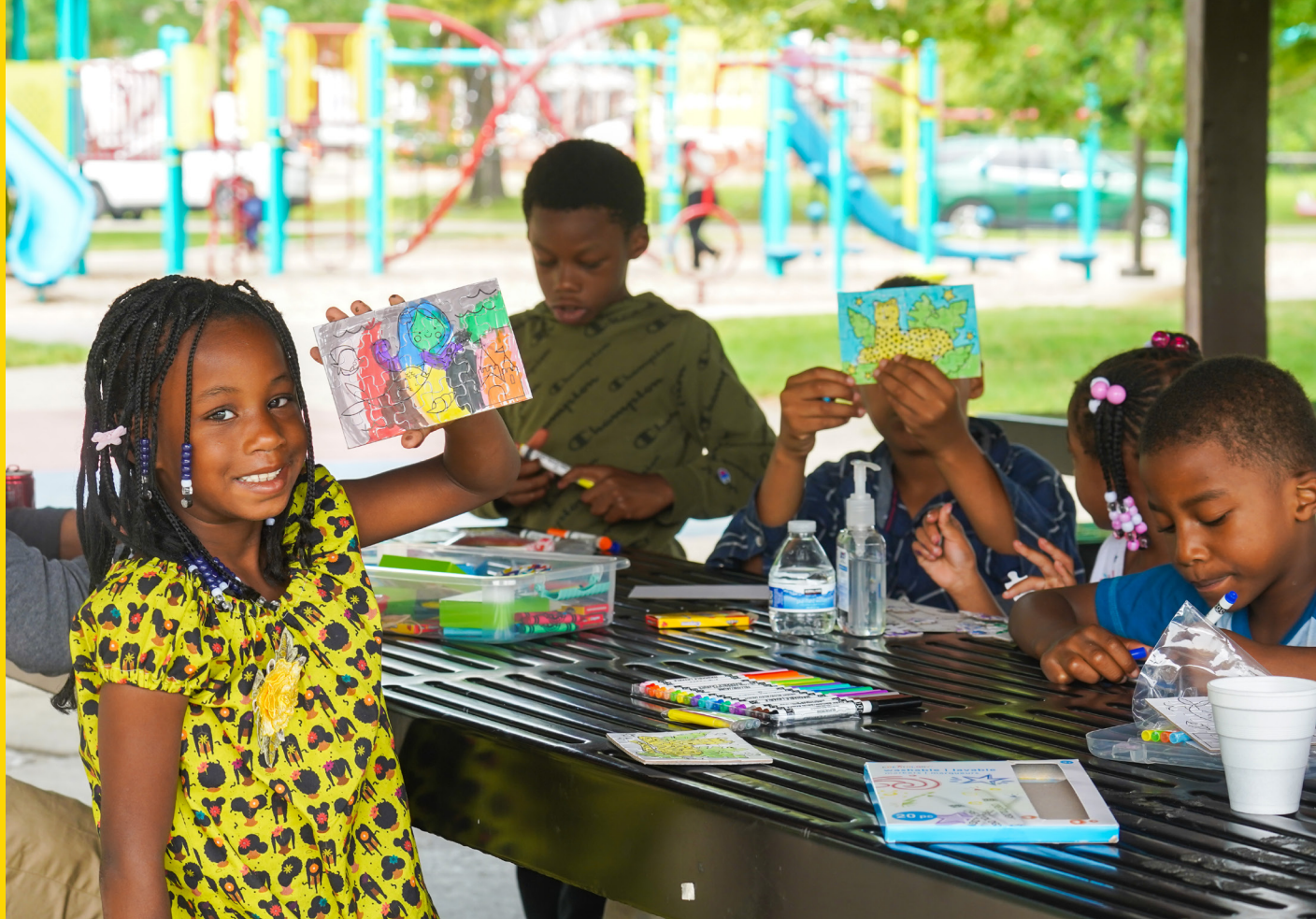
Pistons Neighbors Program, Delores Bennett Park.