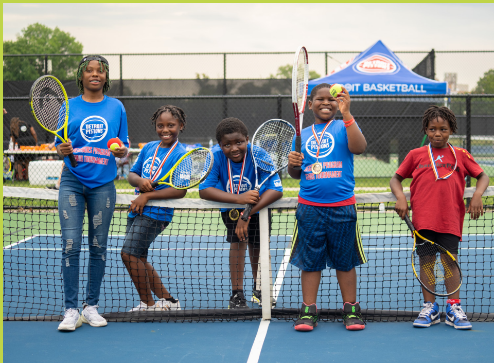
Pistons Neighbors Program, Delores Bennett Park.

On August 26, Palmer Park's tennis courts hosted a tournament for kids ages 6-17. Tennis students from across the city gathered to meet, test their skills, and play together. Presented in partnership with the Detroit Pistons Foundation, USTA, Motor City Tennis Club, and Palmer Park Tennis Academy.