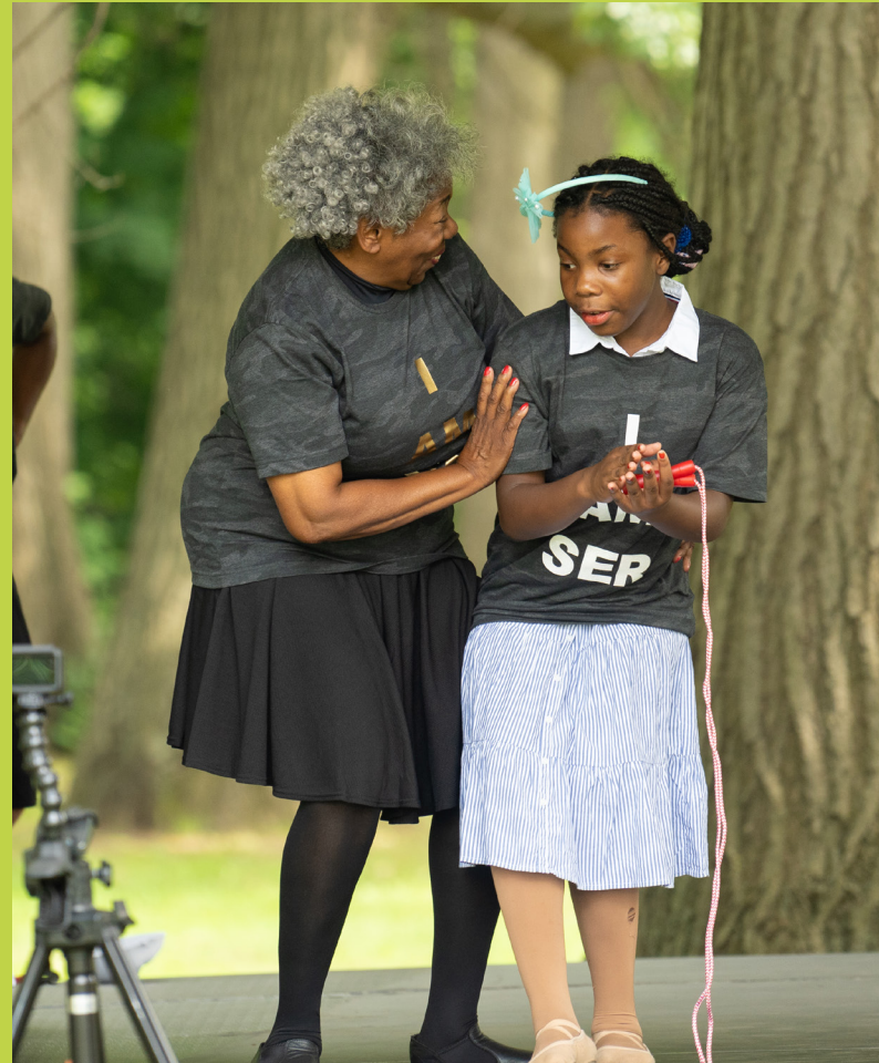
Freedom Arts Festival, Palmer Park.