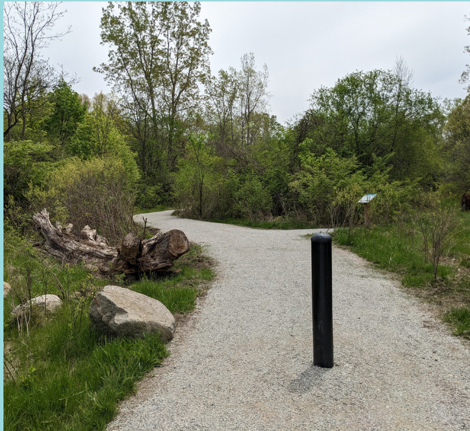
Eliza Howell Park Walking Path Improvements.

The River Trail in Eliza Howell Park is one of its most utilized walking paths, going from the park's main road through the woods to the Rouge River. After a community visioning process, Sidewalk Detroit set out to pave the path and install a railing, bringing the path into ADA compliance and increasing accessibility to the river.