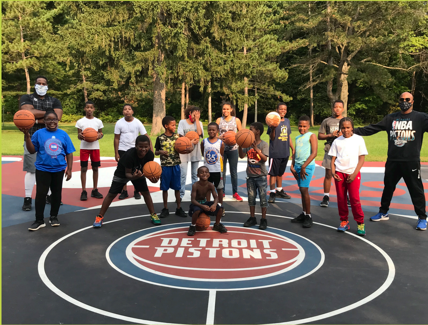
Pistons Neighbors Program, Palmer Park.