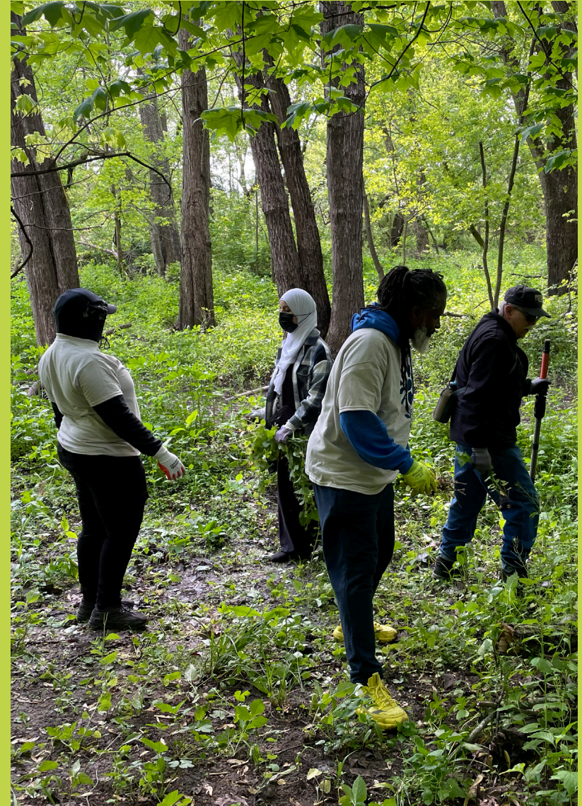
Rouge Park Appreciation Day.

We envision a city of welcoming and beautiful parks and public spaces in support of a vibrant, inclusive, and thriving Detroit. Our parks provide quality amenities, preserved natural areas, rigorous maintenance, and creative programming in service of that goal.