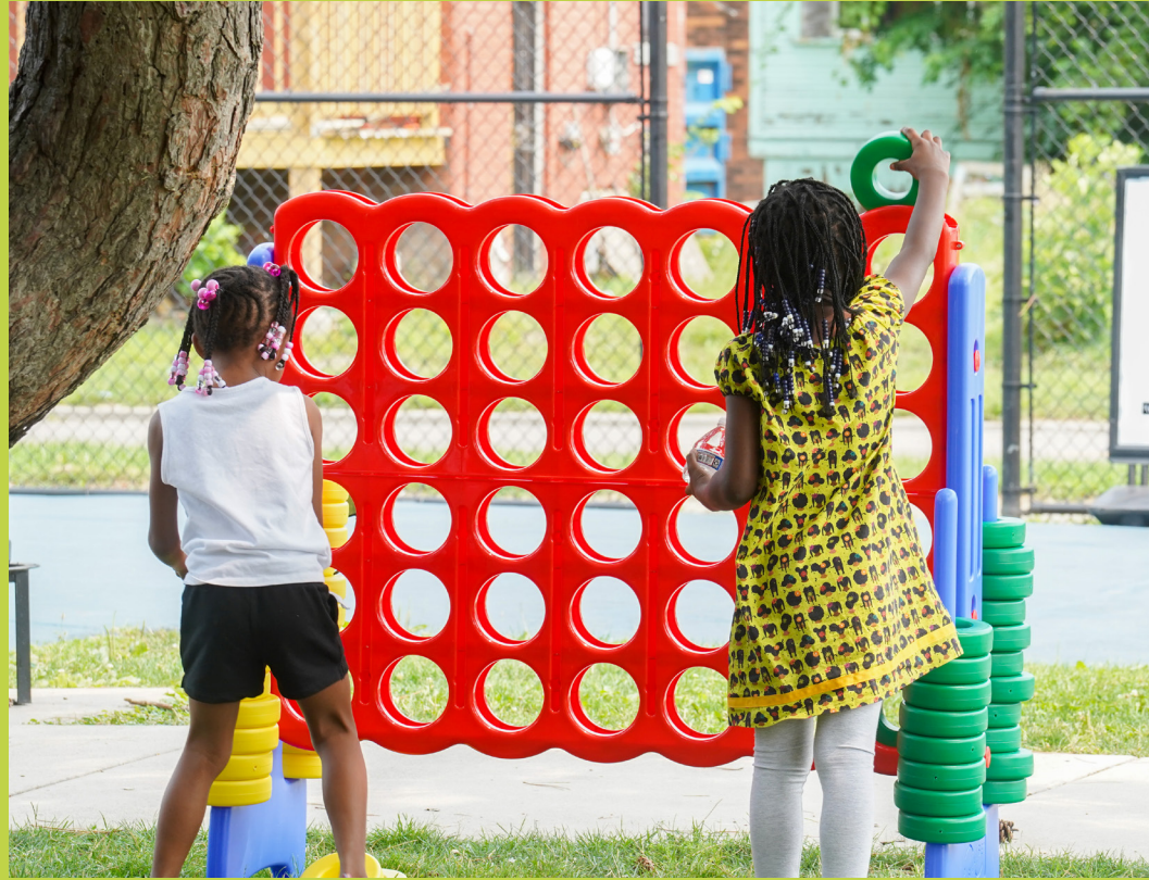
Pistons Neighbors Program, Delores Bennett Park.

Chandler Eliza Howell Clark O'Hair Cool Cities Palmer Curtis Jones Rouge Delores Bennet Skinner