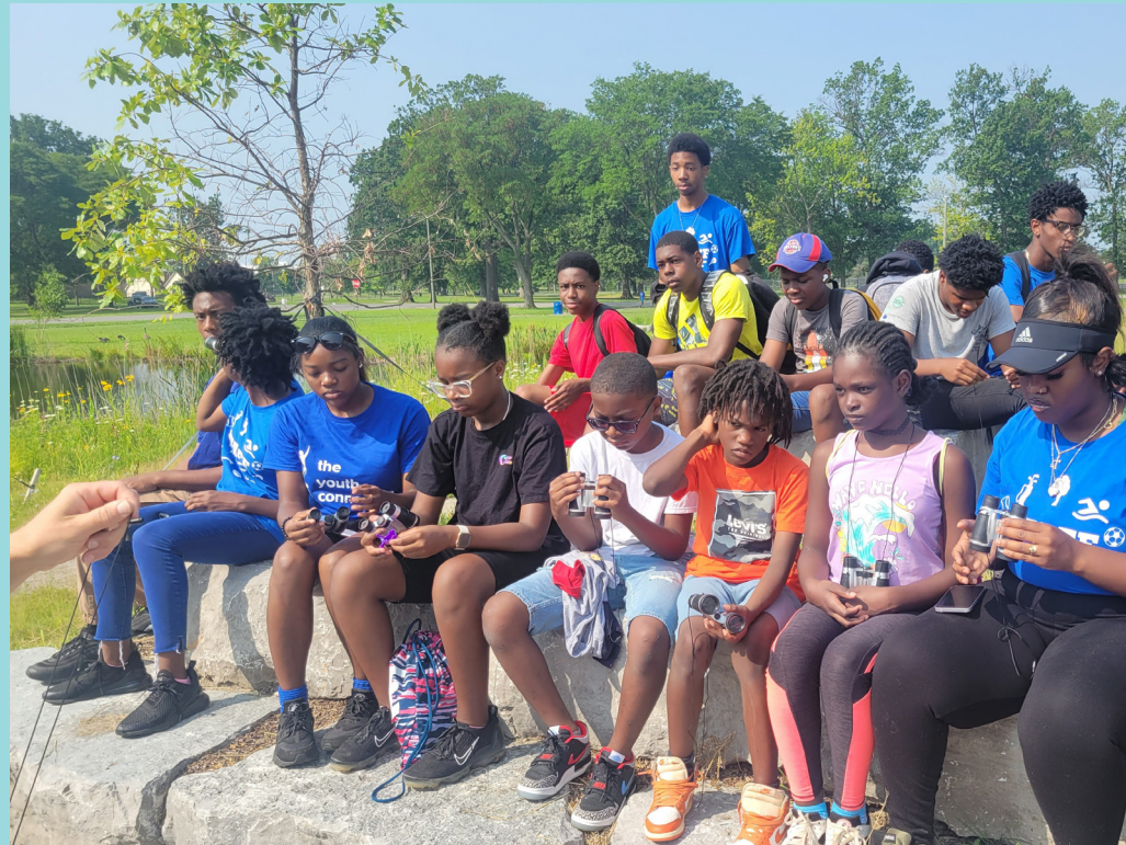
Chandler Park Environmental Education Pavilion.

The marshland at Chandler Park is one of the biggest habitat restoration and stormwater management projects in Detroit. Adding an outdoor classroom has allowed Chandler Park Conservancy to host environmental education workshops, connecting urban youth to natural space. Whether exploring the diverse ecosystems, participating in workshops, or simply enjoying the serene surroundings, individuals from all walks of life find the area to be a place of inspiration, learning, and meaningful connections with the natural world.