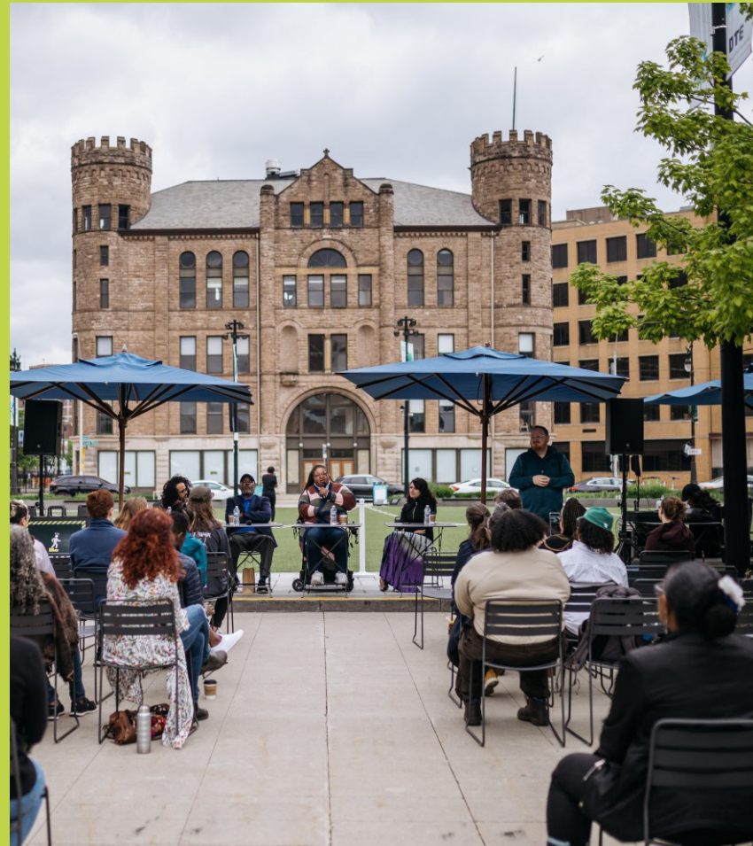
Just Place, Beacon Park.