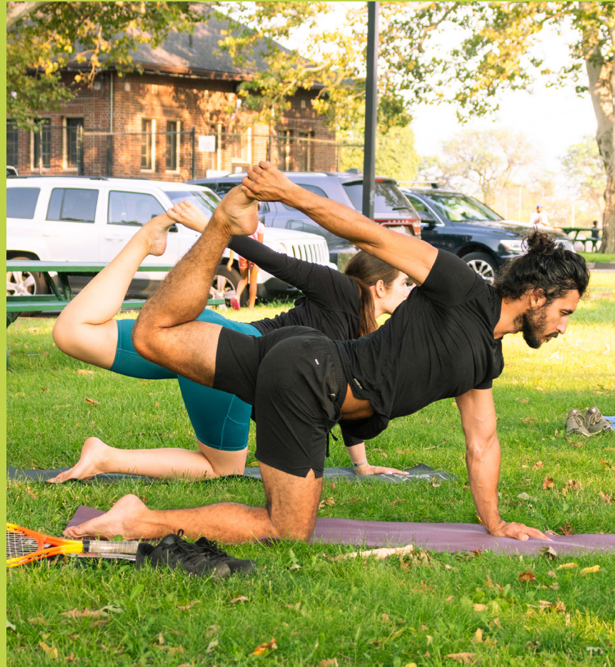
Yoga in the Parks, Clark Park.