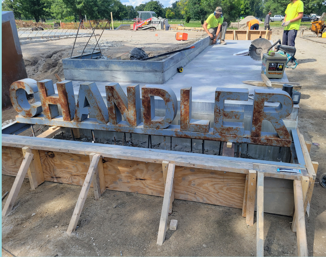
Chandler Park Skatepark, Chandler Park.