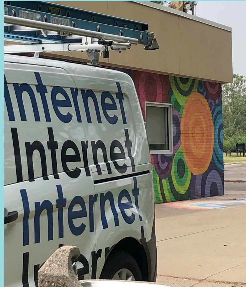
Park WiFi Installation, Palmer Park.